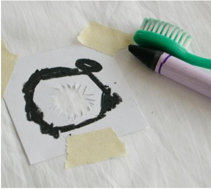
Applying Black Fabric Crayon