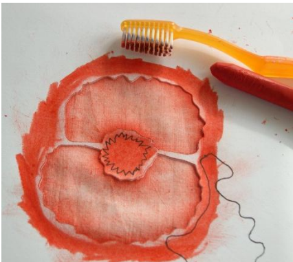
Applying Red Fabric Crayon