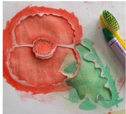
Applying Green Fabric Crayon